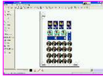
Mix any shape or size images onto the same sheet !